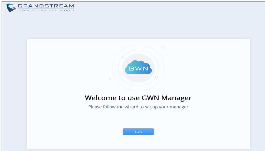
Figure 8: GWN Manager initial Web page

Below figures show the initial page after installation. On first use, users need to fill in additional information following the initiation Wizard. Click start to begin. For more detailed information please refer to the GWN Manager User Guide.