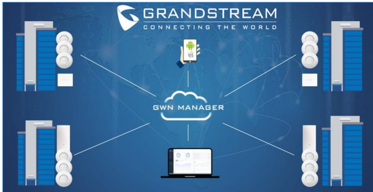
Figure 1 : GWN Manager Architecture

GWN Manager is an On-premise Access Points Controller used to manage and monitor GWN Access points on your network. It provides an easy and intuitive web-based configuration interface, The GWN Manager can control up to 3000 GWN access points, from different models. Below is the GWN Manager architecture: